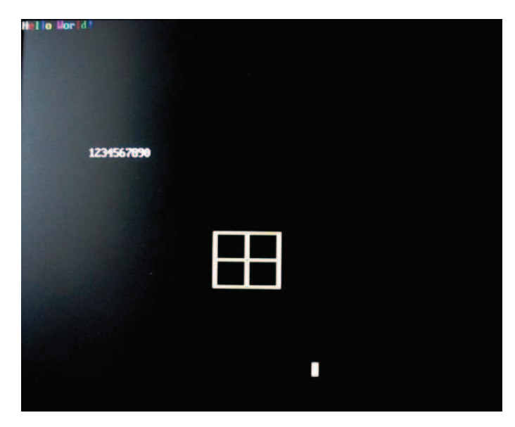
Figure 1: Example screen layout.

The controller organizes the screen into 80 columns by 30 lines. All 256 ASCII characters are supported and decoded using the Western European Codepage (CP850)[1]. Figure 1 contains an example output generated by the video controller.